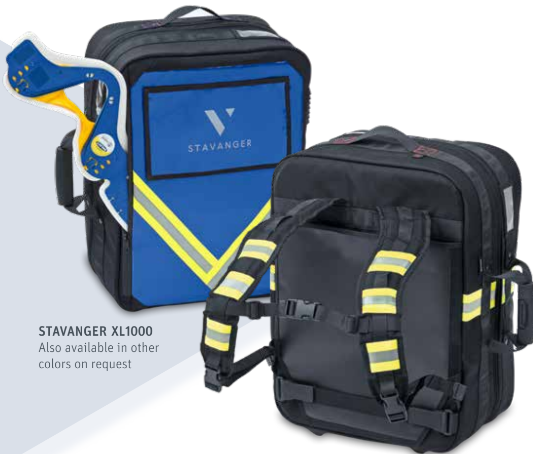
STAVANGER XL1000 Also available in other colors on request